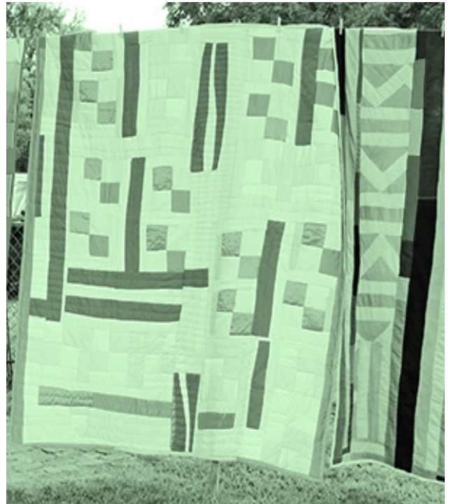
This recycled textile was made by the women of Gee's Bend a small, remote, black community in Alabama, America.