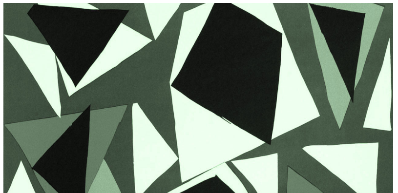
Henri Matisse also uses shapes cut from paper.