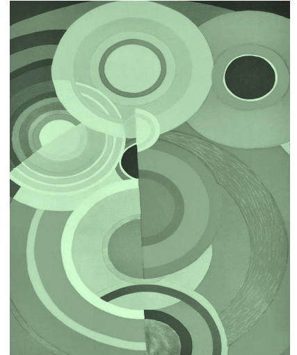
Sonia Delauney's work features colourful shapes.