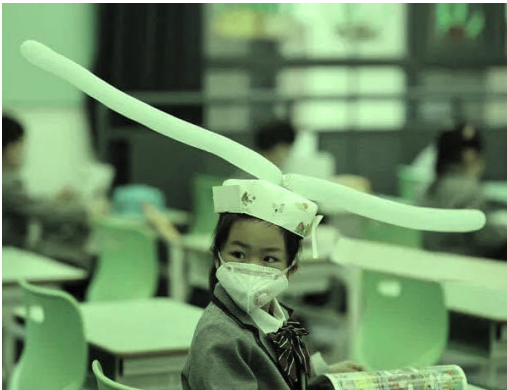
A hat made out of a balloon to keep a safe distance of two metres.

Create your stylish or silly piece of safety wear inspired by your mood-board.