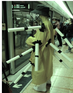
A 3D outfit made from tubing.