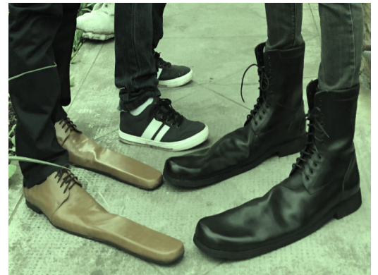
Silly stretched shoes to keep a safe distance in a fun way!

You will need: scissors, glue, pens and recycled materials.