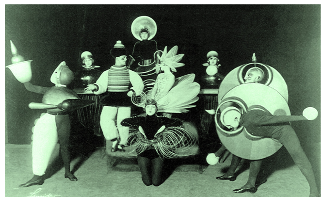
Oskar Schlemmer's, triadict ballet, 1922.