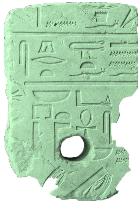
An Egyptian artefact.