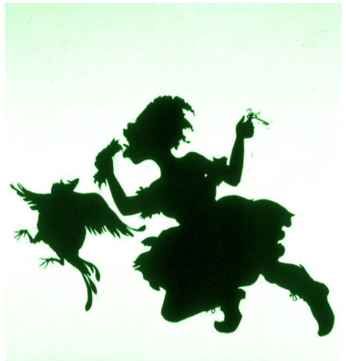
Cut out characters by artist Kara Walker.