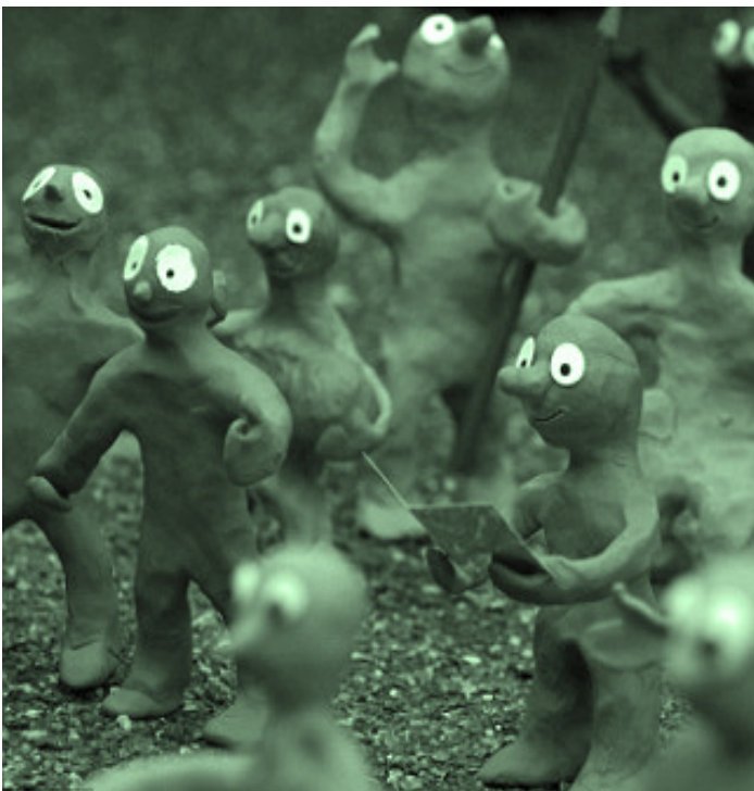
Plasticine figures from TV animation Morph, created by Peter Lord & David Sproston.