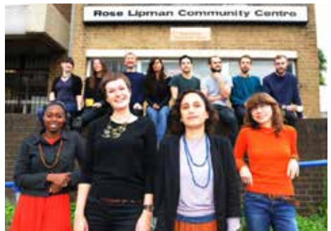
OSE alumni 2013-14