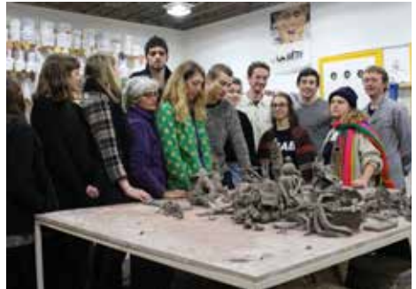
OSE alumni 2016