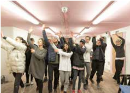
OSE alumni 2017

Alumni have gone on to exhibit and perform at UK venues such as De La Warr Pavilion, Chisenhale Gallery, Turner Contemporary, Tate Modern and Britain, and internationally at the Venice Biennial, Apex Art in New York and the Baltic Triennial.