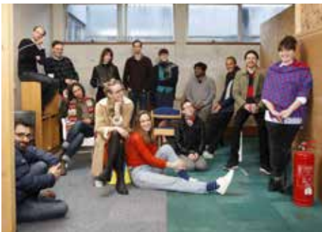
OSE alumni 2015